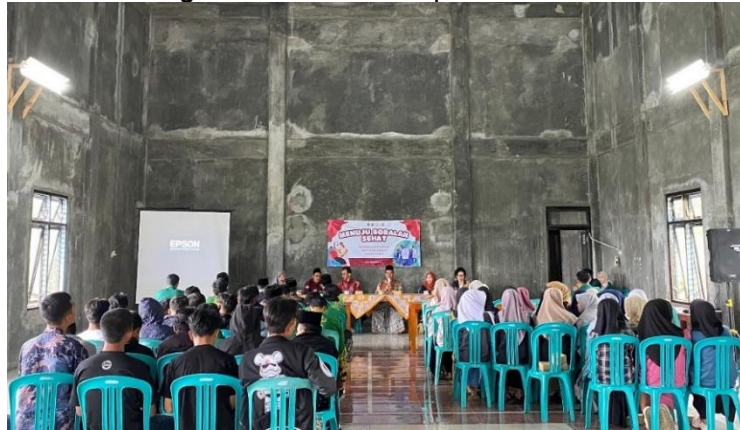
Figure 2. Focus Group Discussion