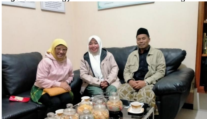
Figure 1. Strategy Discussion with PKBM Management

The assistance program successfully engaged multiple stakeholders, including families, schools, community leaders, and the Community Learning Center (PKBM), fostering a collaborative environment to address these challenges. Initial observations and interviews revealed that many parents lacked awareness of the long-term benefits of education, and children often lacked motivation due to insufficient role models and limited learning support at home.