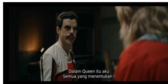
Figure 6. Freddie dominates every decision in the band.

Data6#: Freddie change the Queen genre, which was synonymous with rock, into a disco where all the member of the band did not like Freddie's decision (01:16:10 – 01:16:30)