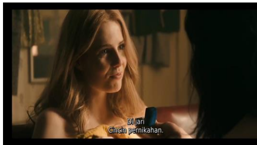
Figure 2. Freddie propose Mary Austin

Data#2: Heterosexual where at this moment Freddie gave a ring to Mary Austin and asked her to put on her wedding finger. (00:25:40 – 00:25:50)