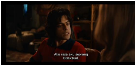
Figure 5. Freddie tells the truth that he is a bisexual.

Data#5: Freddie Mercury declared himself as a bisexual to Mary Austin, at minutes (00:54:20 – 00:54:24)