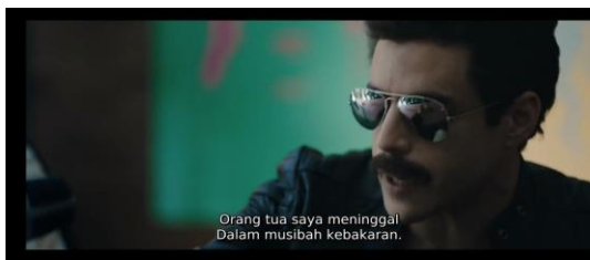
Figure 7. Freddie conducting interview with the media.

The figure above shown Freddie was conducting an interview with the media and asked several questions about his personal life. Media crews began to highlight Freddie's life with his male lovers and came to the questions about his parents. Freddie gave a surprising answer where he said his parents had died where it was just to save his own career.