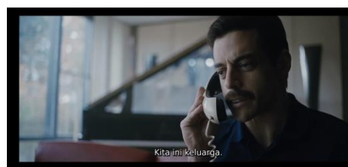
Figure 10. Freddie calls the manager about Live Aid concert.

Data10#: Freddie contacted Queen's manger about a concert at Live Aid and asked him to meet the other Queen's member. (01:37:20 – 01:37:38)