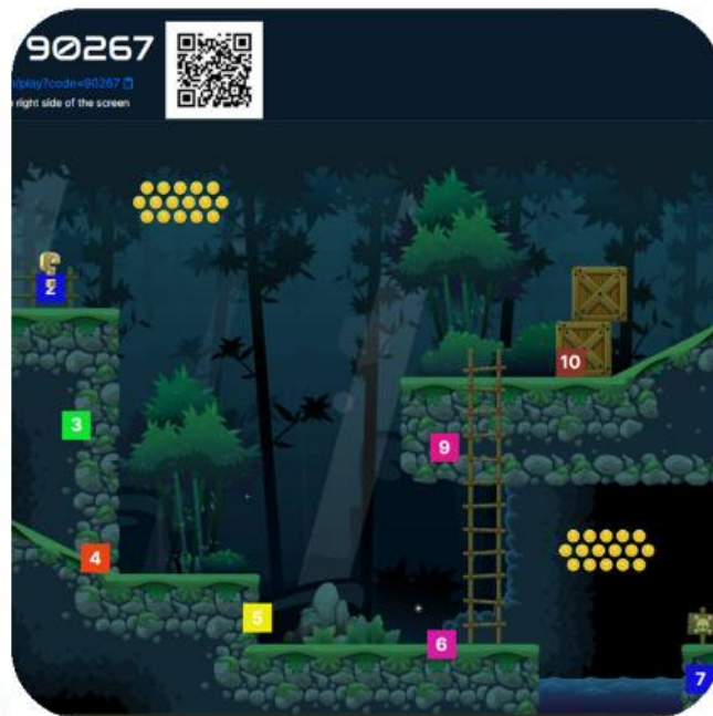
Figure 2. Game Learning Design

In the design stage, the objective is to create the educational media that will be developed. The design activities in this research involve crafting a design for interactive game-based learning media using the Quiz whizzer application. At this stage, the researcher needs to outline the framework for the interactive game learning media, which includes creating questions and answer keys, designing player icons featuring cartoon and fictional characters, setting the game background to resemble an adventure, and incorporating weapon features for the players. This design aims to engage students and encourage their active participation in teaching and learning activities. Below is the design created by the researcher.