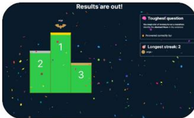
Figure 3. Final Learning Outcomes Using Media

Based on the image above, one of the main advantages of using Quiz Whizzer is the instant feedback provided after students answer questions, allowing them to understand their mistakes and improve their comprehension of mathematical logic concepts immediately. In addition, teachers can use the quiz data to evaluate students' understanding of the material taught, helping them identify areas that need reinforcement and design subsequent learning activities. Furthermore, students are taught to apply logic in everyday problem-solving, thereby enhancing their critical and analytical thinking skills.