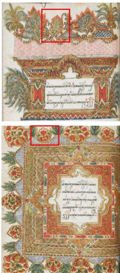
FIGURE 1. Illumination page 22v – peacock figure (above) & page 30v – floral figure (below)

There are certain motifs from several Serat JLW