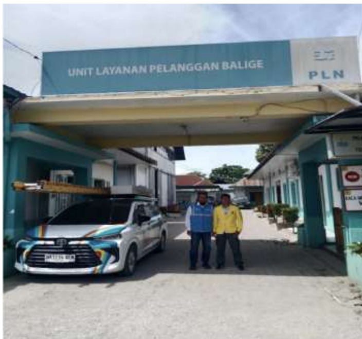
Figure 2. Location of the Research

Based on distribution network disruption data collected from internal reports of PT PLN ULP Balige during the period May 2023 to April 2024, it is known that there is a total of 536 incidents of disruption, which is divided into two main categories, namely permanent impairment and temporary disruption. Internal permanent disturbance is dominated by damage to Medium Voltage Network (MVNet) components such as distribution transformers and isolators, with a total of 92 disturbances. External permanent disturbance is mostly caused by natural disasters such as fallen trees and lightning strikes, as many as 108 disturbances. Internal temporary disturbance reaches 137 incidents, generally caused by load surges and contact between conductors. External temporary disturbance is the most dominant with a total of 199 disturbances, caused by kites, pennants, wild animals, and human interference.