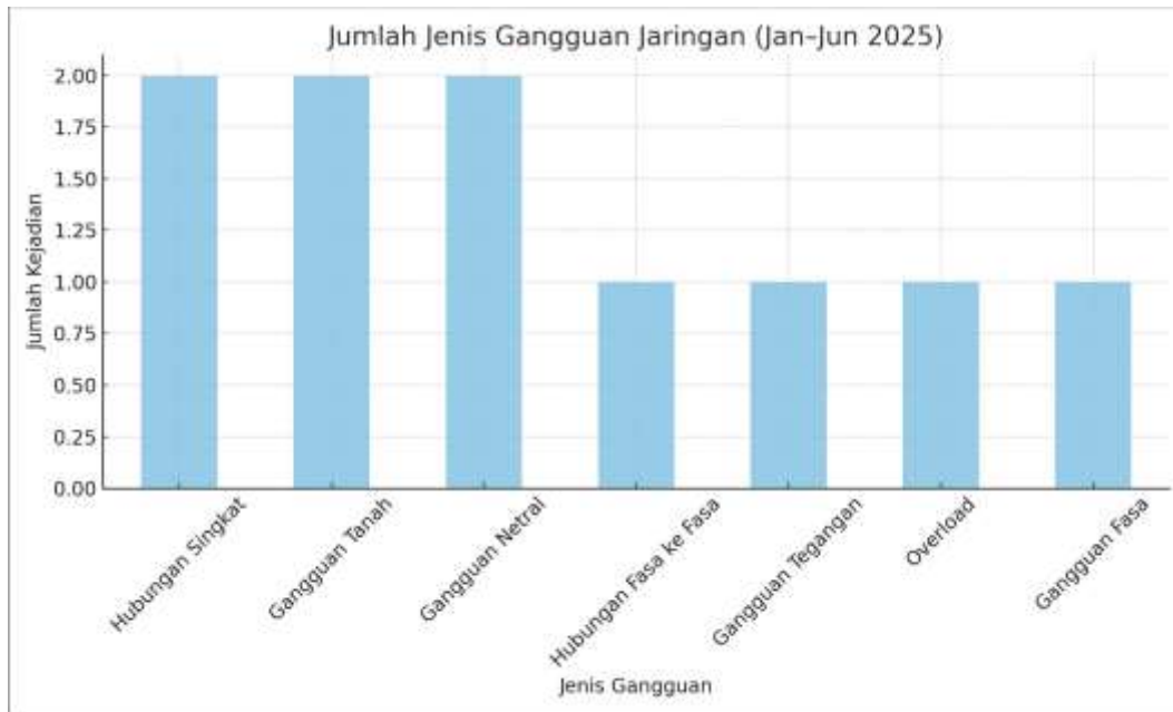
Figure 1. Temporary disturbance data (internal and external)