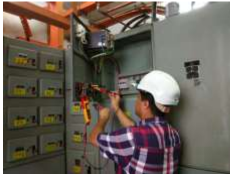
Figure 1. Testing Process with Megger