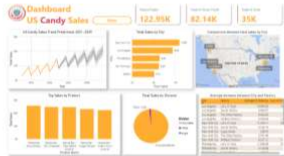
Fig 2. US Candy Sales Dashboard

The processed and analyzed data is presented in an interactive dashboard that facilitates monitoring, evaluation, and decision-making regarding product distribution. The visualization results can be seen in the following figure: