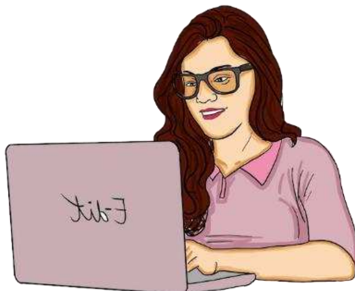
Figure 2. The character used for the interactive media of eight standard of public service on bureaucratic reform at the Indonesian Art Institute Denpasar

The characters used in the interactive media standard public service procedures in bureaucratic reform at the Indonesian Institute of the Arts Denpasar are a combination of wayang characters wrapped with modernization elements and packaged with a little cartoon nuance. These characters chosen to seem humanistic, in accordance with Balinese culture, and adapt to the characters used in several visual communication media from information on the application of eight public service standards at the Indonesian Institute of the Arts Denpasar. However, what makes it different from the previous characters, where the characters used in this interactive media character are made in their entirety from head to toe and the characters are used in colour. The characters used are the puppet characters Merdah and Tualen , where the Merdah character is designed to represent the community or someone who wants to get information. Meanwhile the Tualen character represents the staff member who provides services to the community, as well as four other characters such as the Condong dancer character who represents female visitors, then the character of the editor, the character of a bank teller and the character of a reviewer.