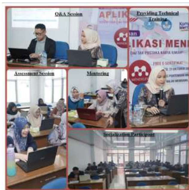
Figure 3 Activity Documentation

really helped me understand reference management, especially for my thesis," indicate that participants realized the real benefits of using Mendeley in supporting their academic assignments.