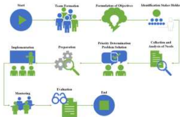
Figure.1 Workflow of activities