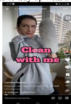
Figure 6. Example ( https://vt.tiktok.com/ZSYJXKMmN/ )