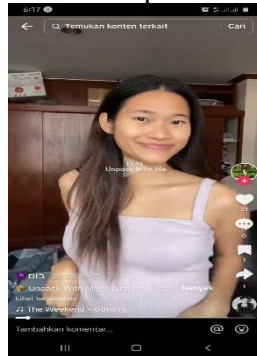
Figure 4. Example ( https://vt.tiktok.com/ZSYJC9rtf/ )