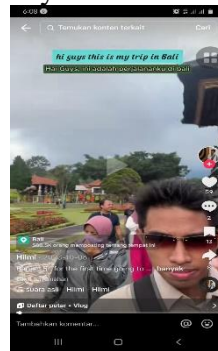
Figure 8. Example ( https://vt.tiktok.com/ZSYJCXhJp/ )