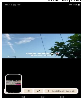
Figure 9. Example ( https://vt.tiktok.com/ZS22YnU66/ )