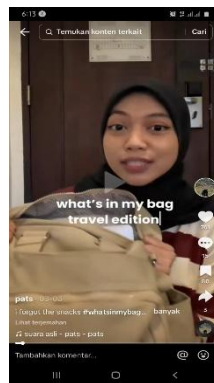
Figure 5. Example ( https://vt.tiktok.com/ZSYJCxS7t/ )