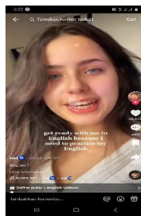
Figure 1. Example ( https://vt.tiktok.com/ZSYJCaYPg/ )

As reported on the blog (Shree, n.d.), here are several types of mini vlog: