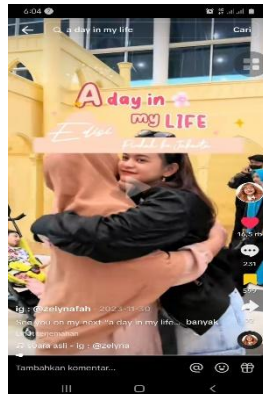
Figure 3. Example ( https://vt.tiktok.com/ZSYJcmF9j/ )