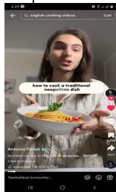
Figure 7. Example ( https://vt.tiktok.com/ZSYJCK3gB/ )