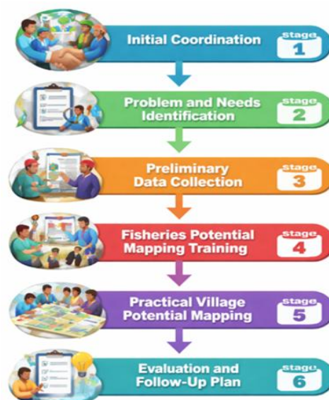
Figure 1: Stages of Community Service Activities

The implementation method of this activity uses a community service approach based on participatory training. This approach was chosen because it not only places the community as participants but also as the primary source of information in the process of identifying and mapping the potential of capture fisheries. The activity is carried out through a combination of lectures, focused group discussions (FGD), field observations, simple mapping practices, and assistance in preparing potential maps. Through this method, participants not only gain conceptual knowledge about capture fisheries potential and coastal economics but are also guided to recognize fishing areas, fishing seasons, types of catches, supporting facilities, and opportunities for developing marine resource-based businesses in a systematic and practical way. The stages of this community service activity are illustrated in Figure 1 below.