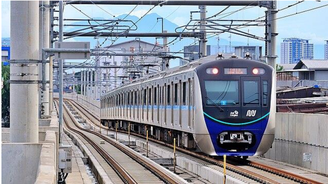
Figure 2. An MRT in Jakarta

This MRT station is located between 3 subdistricts, namely Subdistrict Kebayoran Baru (52.10 %), Tanah Abang District (45.73%), and Subdistrict Kebayoran Lama (2.18%) are located in Central Jakarta and in South Jakarta with density the average population is 148 people / ha and including in category density resident low. Within a radius of 800 m from transit point, there are 14 types of subs use zoned land as diversity tall. Ratio residence and non-residential is 28.39 %: 71.61%, which includes in category very high with wide land residence amounting to 62.81 ha and wide non- residential land amounting to 158.40 ha [10]. Senayan MRT Station transit area has all over completeness pedestrian facilities, crossings, and bicycle track [11][12]. This station integrates with busway stop far away about 110 meters, and has proximity with BRT stop Route Blok M to Kota Station, Ragunan to GBK via Tendea, Pinang Ranti to round about Senayan, Tanjung Priok to Blok M, and Kalideres to GBK [8].