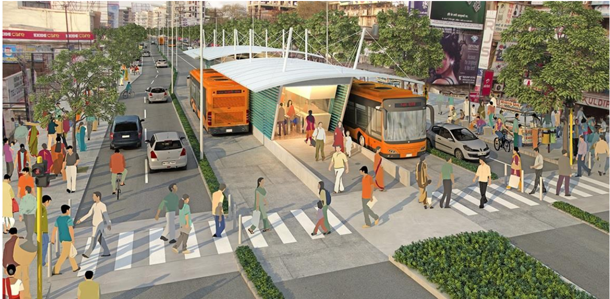
Figure 1. Application of Transit Oriented Development (TOD) Concept in City Planning