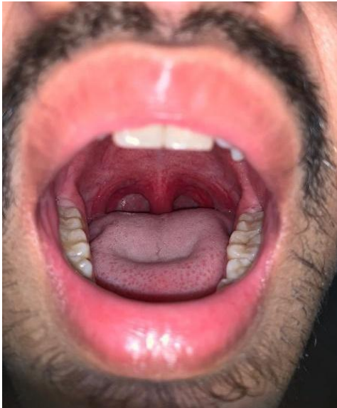
Figure 1. Hyperemia of the uvula and soft palate of the oropharynx