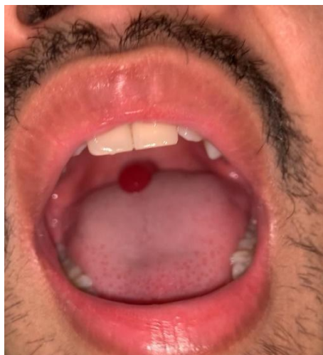
Figure 2. Edema of the uvula, and the uvula appears elongated