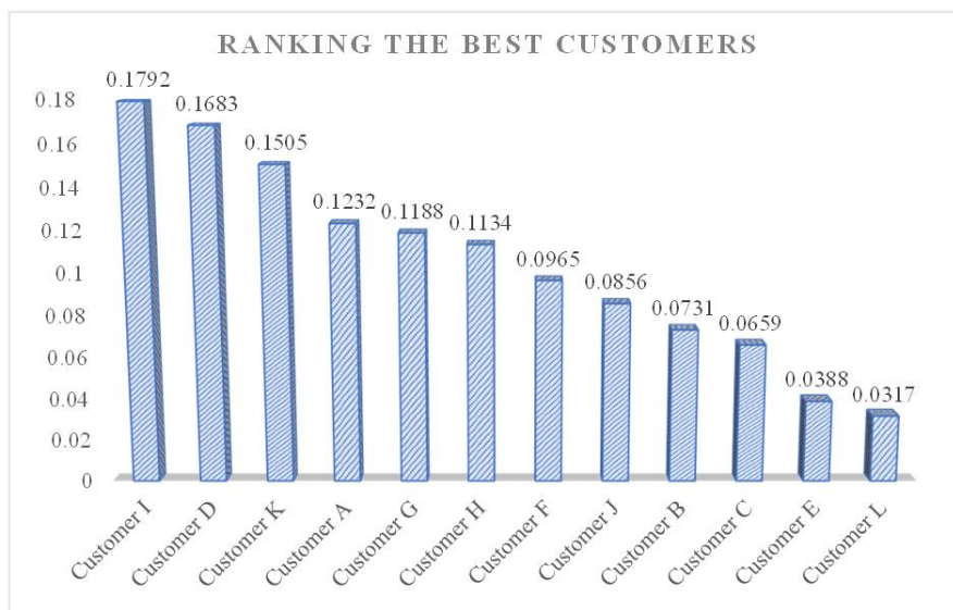
Figure 2. Ranking the Best Customer

The ranking of the best customers can be done using the GRA Method, Customers are then ranked based on GRG values with the highest value indicating the best customers in the context of the criteria set. This method allows the company to objectively assess and select the best customers based on relevant criteria. Figure 2 is the result of ranking the best customers using the GRA method.