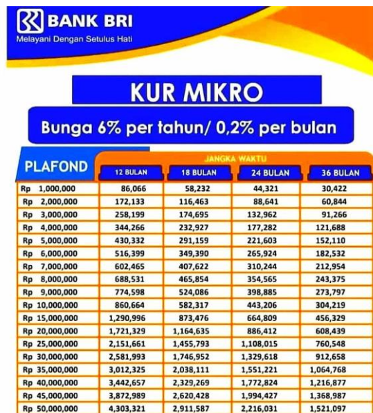
Figure 1. KUR installments