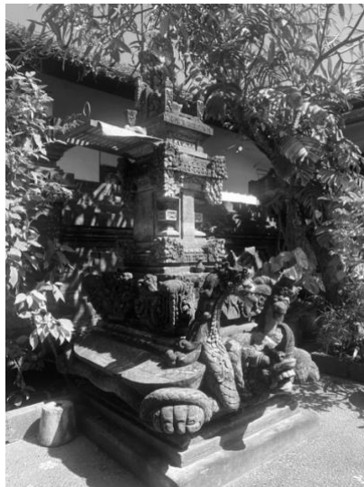
Figure 2. Bedawang Nala on the Padmasana Building in Bali

Based on the analysis of the philosophical meaning of Bedawang Nala above, we can see different and unique forms in every pelinggih in Bali. However, it can generally be depicted as a giant turtle with flame hair, a gaping mouth, and entwined by 2 dragons. The size of The Bedawang Nala is adjusted to the size and area of the pelinggih buildings in Bali. In general, philosophically, the giant turtle means the support of the earth, the two dragons mean balance, and the turtle's mouth that emits fire means the earth's magma or the earth's core. So, The Bedawang Nala concept cannot be separated from events on earth, namely the impact of The Bedawang Nala movement. When connected to modern science, this concept can be identified with movement from within the earth, which is called endogenous movement. What is meant by endogenous movement is the overflow of underground water, which causes erosion of sloped land, resulting in erosion and flash floods.