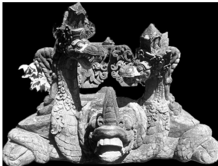
Figure 1. Bedawang Nala in the Padmasana Building