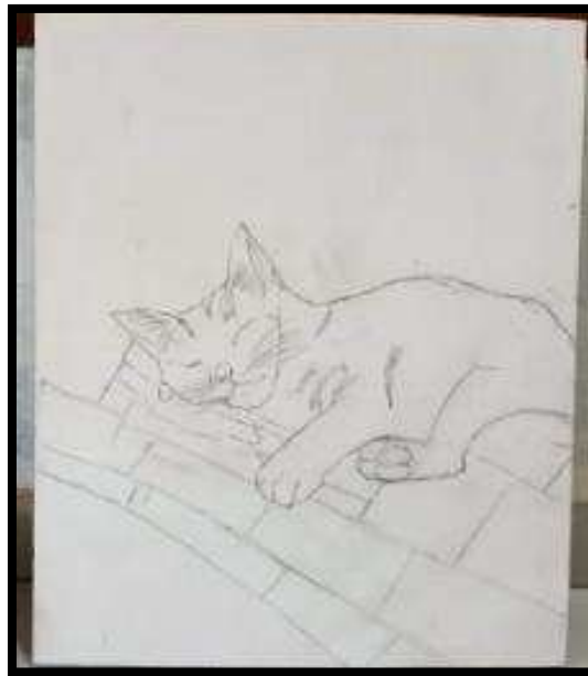
Figure 4. Sketching Process