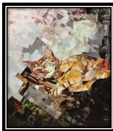
Figure 5. Title: Sobriety (Calmness), Size: 50 × 60 cm, Medium: Tissue Paper and Magazines, Year: 2024 Artist: Ayu Widari Syahfitri