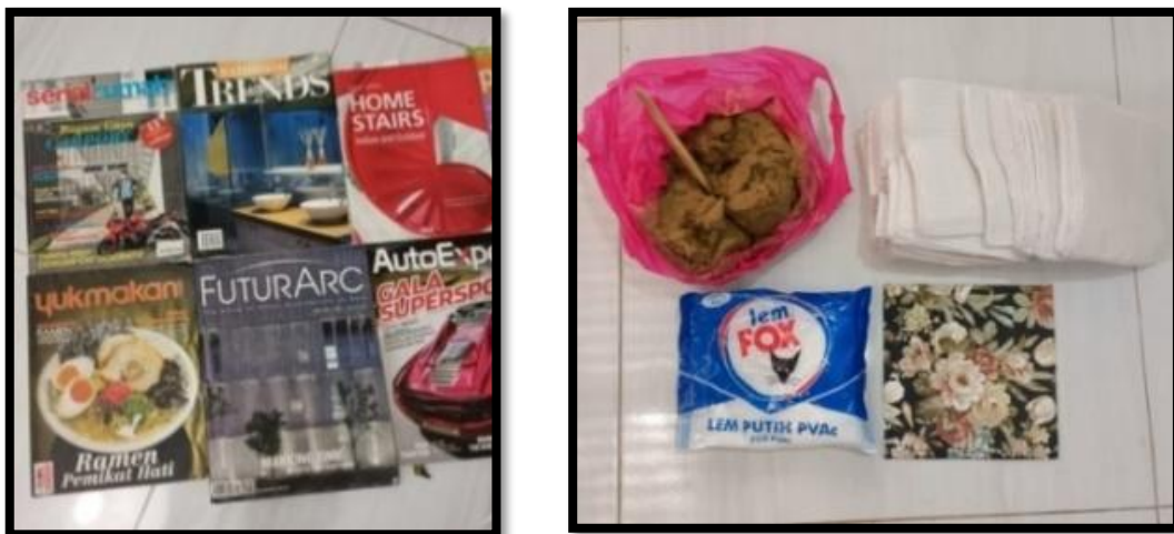
Figure 3. Tools and Materials

The tools and materials described previously—including pencils, clay, glue, tissue paper, magazines, and twelve prepared canvases—are used in the process of creating the collage artworks using the assemblage technique. The author gathered a variety of materials and magazine patterns deemed suitable for achieving the desired visual form of the artworks.