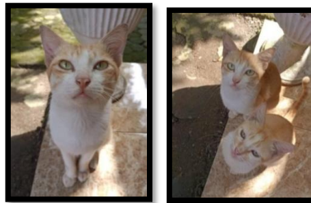
Figure 2. Visual Exploration of Cat Behavior

techniques, materials, and concepts to produce artworks that are personal and unique. During the exploration phase, regular observation is required to sharpen the artist's sensitivity. In the context of visual exploration, the author examines and observes the forms, behaviors, and objects related to cats. Developing an understanding of aesthetics and artistic skills is an essential aspect of artistic practice.