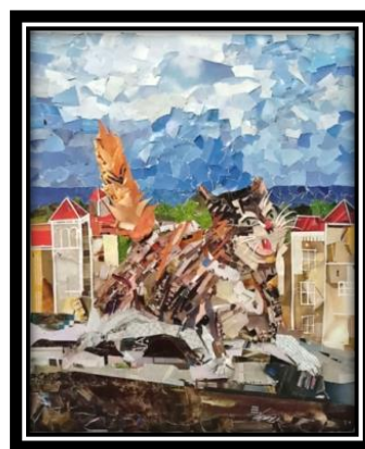
Figure 6. Title: Roof King , Size: 50 × 60 cm, Medium: Tissue Paper and Magazines