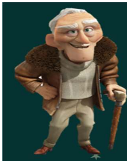
Figure 4. Muntz (Greed)

By the end, it's a classic Bad Guy vs. Good Guy battle with death on the line. It is worth noting that after the opening newsreel montage, which depicts Muntz, this Nemesis figure doesn't emerge until late in Act Two. The script does an excellent job of intertwining different characters that create an opposing dynamic to Carl Russell, a thunderstorm, Kevin, and the constant annoyance of needing to move Carl's residence until Muntz reappears in the plot. Finally, Muntz's dogs, particularly Beta (Delroy Lindo), are members of Muntz's team and serve as a nemesis.