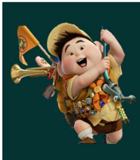
Figure 3. Russel (Brave)