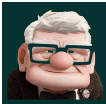
Figure 1. Carl Fredricksen (Loyalty)

The narrative is told from his point of view. Carl Fredricksen, who is 78 years old, is a man. Beginning with young Carl, we learn about his passion for adventure. The plot follows Carl as he meets his adventurous soulmate, young Ellie. Carl is profoundly affected by their relationship, marriage, and Ellie's tragic death, all of which are depicted in a montage. And for the remainder of the novel, regardless of what people are presented, the dynamic is virtually always predicated around Carl. It is Carl's desire to keep his promise to Ellie and travel to Paradise Valley in South America that drives the plot and determines the film's conclusion. Carl's character undergoes the most significant change, achieving his goal of bringing Ellie in the form of his memories of her, her Book of Adventure, and the house itself to the exact spot atop Paradise Valley by the waterfall before embarking on a new adventure with Russell, Dug, Kevin, and the others. In addition, Carl transforms from loathing Russell into Russell's surrogate father. And Carl's mood transforms from that of a grumpy old guy counting down the days till his death to that of an enthusiastic, lively, and 'alive' version of himself.