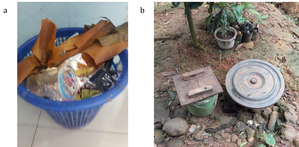
Fig. 4 Transmigrant's waste storage at home (a) Organic and inorganic waste to be burned are still mixed, (b) Waste stored in a bucket is covered to prevent exposure to rainwater

The difficulties transmigrants face in managing waste are a domino effect of several interrelated factors. The absence of specific regulations that encourage a circular economy-based approach to waste management can lead to poor waste management practices at the household level (Dlamini & Zikhali, 2024). This condition is exacerbated by the lack of policies favoring waste management in transmigration areas and the absence of adequate supporting facilities, infrastructure, and systematic socialization and education efforts related to ideal waste management.