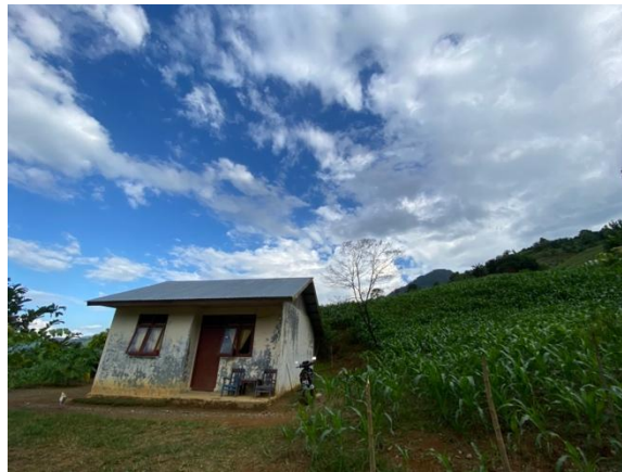
Fig. 1. Transmigrant house and yard

Transmigration areas, as the forerunners of new villages, must prioritize proper waste management. Untreated rural waste can lead to health problems, unpleasant odors, and environmental pollution that directly affect local residents (Alipour et al., 2025). Considering the variety of household waste types, the yard space available to transmigrants ranging from 0.10 ha to 0.25 ha per household has significant potential for use in community-based household waste management. The presence of community participation in waste management can improve sustainable management systems and public awareness. Community participation in waste management can improve sustainable management systems and increase public awareness (Akeju & Omotoso, 2023). Activities that can be implemented include sorting and processing waste using environmentally friendly methods, such as composting and recycling.