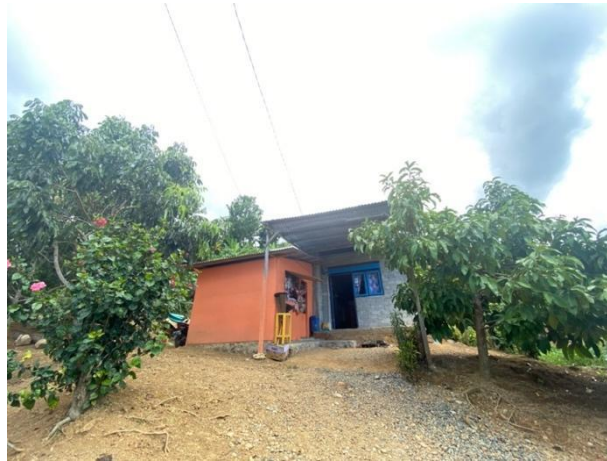
Fig. 2. Used cardboard as a garbage container in the transmigrant house

in waste management, particularly in formulating policies, providing facilities, and ensuring the implementation of effective waste management systems (Akeju & Omotoso, 2023). This informant was chosen due to their understanding of the planning, development, and management of the transmigration area, including waste management policies and facilities.