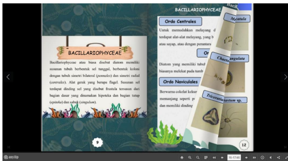
Figure 3. Opening Pages Using Online Display of Electronic Pocketbook

Electronic pocketbooks were pocketbooks displayed on a digital screen that can be carried everywhere containing text or image information [17]. This digital media makes it easy for readers to read without space and time constraints effectively and efficiently [25]. The display of electronic pocketbook true online was seen in Figure 3.