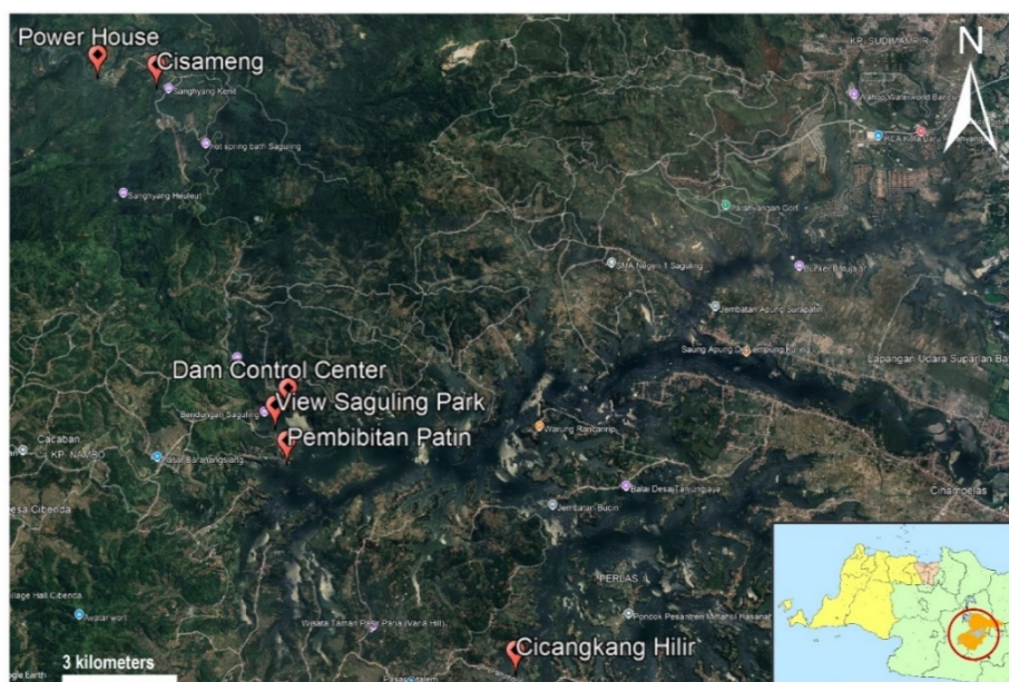
Figure 1. Data collection locations of this study in the area of Saguling Hydroelectric Power Plant (PLTA)

Environmental data collection was carried out from several abiotic parameters at around 10.00 – 11.00 AM local time with several tools including: secchi disc (Zhouzhi 30M) to measure brightness, thermometer (Pyrex -10+110°C) to measure temperature, DO meter (DO9100) to measure dissolved oxygen, TDS meter (TDS-3) to measure dissolved solids, and pH meter (ATC PH-009(I)A) to measure pH. The data was used to determine the condition and water quality from each data collection station. The quality standards used as a comparison include Indonesian Government Regulations No. 22 of 2021 concerning the Implementation of Environmental Protection and Management and No. 82 of 2001 concerning Water Quality Management and Water Pollution Control. Data interpretation from the environmental quality of each station was then tested using multiple linear regression to determine the effect of measured environmental variables on the community structure and diversity of fish in the Saguling Hydroelectric Power Plant (PLTA) area, Bandung Barat Regency.