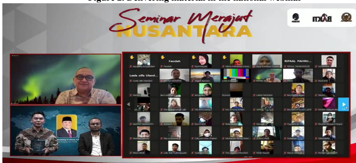
Figure 3. Screenshot view of participants

The discussion also highlights that safe digital practice training should be tailored to the specific needs of target groups. For example, students require a more visual and hands-on approach, while professionals may need more in-depth materials on digital risk management in the workplace. Such adjustments can improve the effectiveness of future training sessions. In terms of impact, the activity successfully boosted participants' confidence in facing digital security challenges. Most participants stated that they felt more prepared to recognize and avoid online scams after completing the training. This aligns with the research by Napu et al. (2024) and Lubis et al. (2023), which emphasize the importance of digital skills in supporting individual and community security.