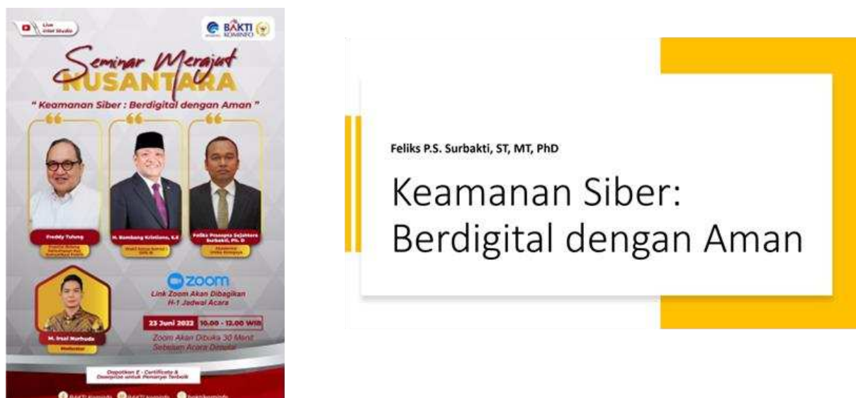
Figure 1. Flyer and presentation materials

The training method used in this community service was not only aimed at increasing knowledge but also at providing practical skills that participants could immediately apply. The use of case simulations and visual aids such as infographics proved effective in enhancing participant engagement and making the material easier to understand.