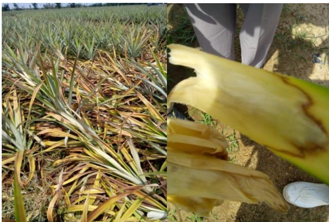
Figure 1. Symptom of heart rot disease caused by Phytophthora sp. in pineapple plantation in Indonesia. Figure in the left is the low magnification of picture, whereas figure in the right is the high magnification.

when a load (or stress, pressure) is applied to a soil (Allmaras et al. , 1988; Fox & Kamprath, 1970). The first impact of compaction is the loss of pore space between aggregates (interaggregate pore space) as the soil volume decreased. The loss of interaggregate pore space has a major effect on water infiltration and drainage, gas exchange and aeration (oxygen diffusion), mechanical resistance to root penetration and proliferation, heat movement, and biological activity of both soilborne pathogens and the host organism (Allmaras et al. , 1988)