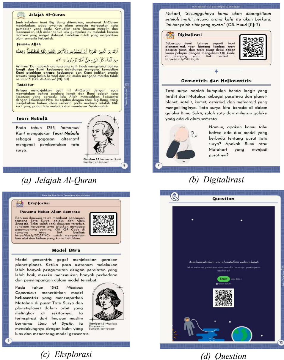
Figure 2. Features of Digital Teaching Materials

the content is enriched with multimedia elements, including educational videos from YouTube, Instagram, and X (Twitter), as well as images, animations, and simulations from NASA and Stellarium, all of which enhance students' conceptualization of astronomical concepts. Fourth, the materials include formative assessments featuring Asesmen Kompetensi Minimum (AKM)-based questions, enabling teachers to evaluate students' science literacy and comprehension effectively. Overall, the integration of Qur'anic verses within the scientific context not only bridges the relationship between faith and knowledge but also encourages students to view natural phenomena as manifestations of divine creation. This holistic approach supports the development of both scientific literacy and spiritual intelligence, aligning with the broader goals of 21st-century education and the Islamic worldview.