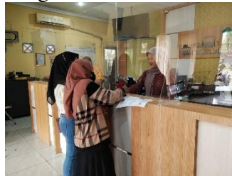
Figure 2. Service Area