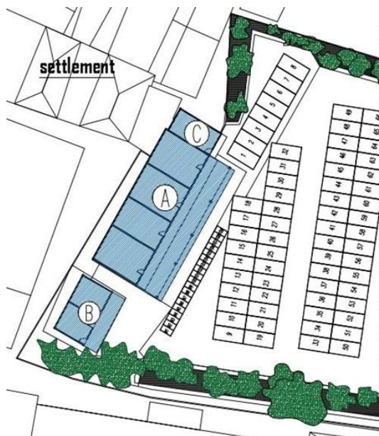
Figure 5. Site Plan (Zulyadaen, 2024)