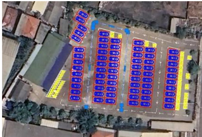
Figure 3. The existing layout of the parking lot of the HKBP multipurpose building in Tangerang City. (Zulyadaen, 2024)

There are currently two parking lots at HKBP Tangerang City Multipurpose Building, namely, next to the church and in the field. All parking lots use 90° and 45° angle patterns. The capacity of the parking lot next to the church is 40 motorcycles. As mentioned above, the parking lots in these two locations are inefficiently used. The researcher tried to collect data and information to process them and reorganize the parking lot so that the congregation can use it as optimally as possible when they worship there.