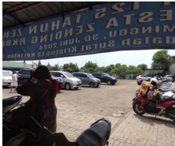
Figure 4. Parking pattern with 45° angle. ( Zulyadaen, 2024)

d. The formula for calculating the capacity of 60° angled parking spaces [15]: N = \frac{L-1,78}{1,2}