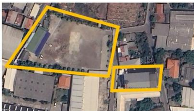
Figure 1. Location of HKBP Tangerang City Multipurpose Building (Google Earth, 2024).

The configuration of the building layout is paramount, with the arrangement of parking spaces for two-wheeled and four-wheeled vehicles exerting a significant influence [4]. It is anticipated that they will be connected following the function and purpose of the building infrastructure, thus ensuring a safe, smooth, and efficient means of transportation devoid of technical, environmental, and architectural barriers. The HKBP Tangerang Kota Church is a place of Christian worship located in the middle of a residential neighborhood (see Figure 1.1). Its address is Gg. Melati II No.16, RT.001/RW.002, Tanah Tinggi, Cipondoh sub-district, Tangerang City, Banten 15148 [6]. The edifice is situated between residential properties (see Figure 1.1). The yellow boxes denote the location of the multifunctional building and the church. The primary church edifice, which is frequently utilized for various activities, is in the orange box on the right.